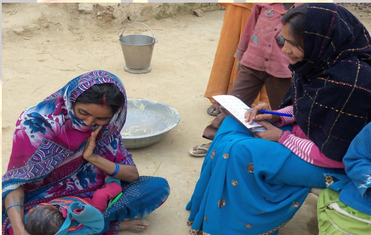
A DEHAT worker interviewing a new born baby's mother