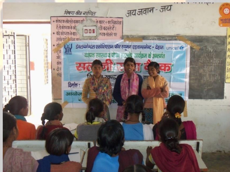
Adolescent Volunteers talk about their initiatives at Saloni workshop in Taj Khudai, U.P.

We have worked with 9629 adolescents (9422 of Saloni Schools & 207 of direct intervention areas) girls of 70 Junior Schools, Inter Collages and 30 IIMPACT learning centres. During the session, 584 thematic monthly meetings organized with adolescents' girls and health & hygiene counseling given for their development, for the Anemia prevention point of view, weekly IFA tablets and on six monthly basis Albendazol tablets mobilized from health department.