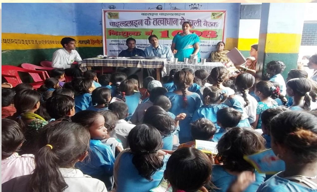
A view inside the Child Line workshop