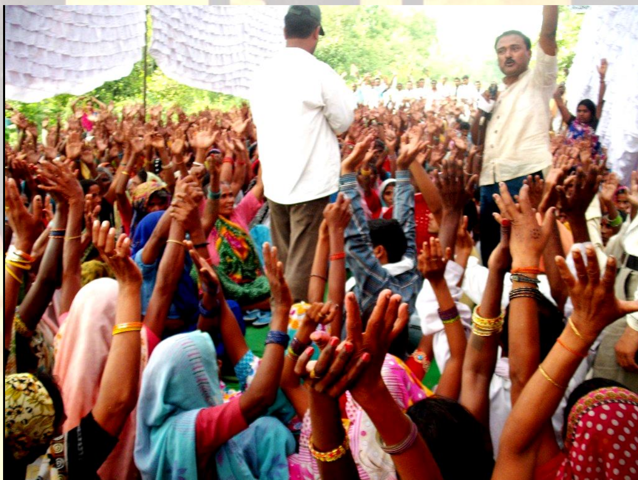
A women empowerment camp for demanding the rights

The project Empowering Rural Women- ERW was initiated in Bahraich District at Mihinpurwa block. The project has been implementing in 10 Gram Panchayat for the period of two years to empower the women of these villages for their livelihood and for other rights through right based approach. The objective of the project is to empower the rural women about their rights, especially right to work, right to information & right to living with dignity and right to equality in the community. To develop leadership among rural women and ensure their access to Government Schemes, programs and Act related to right to food, right to work and empower them in a sustainable way.