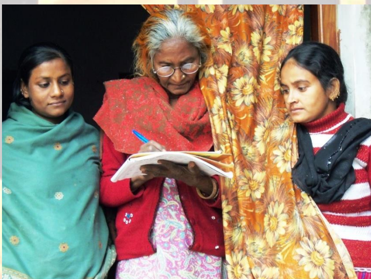
Health Center initiatives have been a huge hit in gathering masses