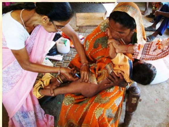
A mother getting her child immunized during a DEHAT health camp